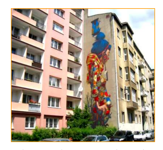
Photo 9. Mural at 12 Uniwersytecka St, Łódź