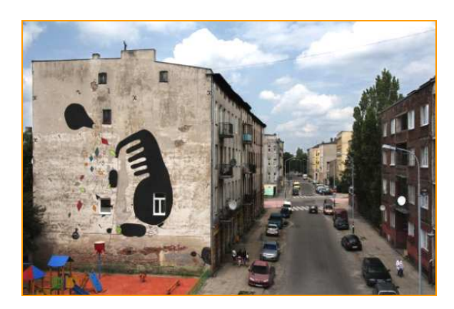
Photo 6. Mural at 25 Pogonowskiego St, Łódź