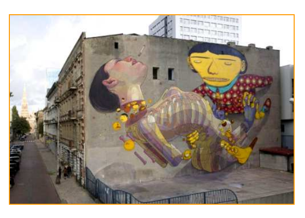
Photo 5. Mural at 5 Roosevelta St, Łódź