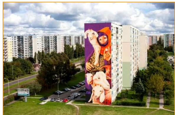
Photo 11. Mural at 80 Wyszyńskiego, Łódź

An interesting example of the creation of a new, attractive place in Łódź by an accumulation of murals is 3 & 12 Uniwersytecka St (Photo 9) and the mural in 59 Jaracza St situated close by. According to the opinion of local residents they are identified with each other and often mentioned together.