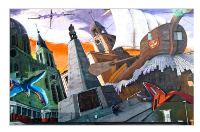
Photo 3. Mural at 152 Piotrkowskia St, Łódź

The opening of the Museum of Art in the 'Manufaktura' shopping mall in 2008 marked a new beginning for murals in Łódź and the first city tour of the murals in Łódź was organized. Interest in street art was gradually increasing. Amateur artists began to be recognized and gained an increasing audience. The allegory of the city on 152 Piotrkowska St created by Design Futura Group in 2001 was the first large scale street art project in Łódź although significantly differing from the other murals created at that time (Photo 3).