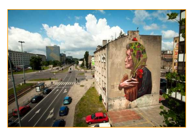
Photo 10. Mural at 16 Politechniki St, Łódź