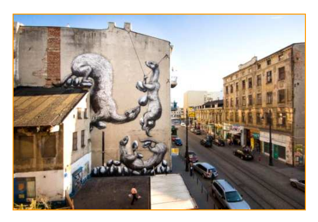
Photo 4. Mural at 5 Nowomiejska St, Łódź

Another group of murals is situated away from the city centre, but close to significant tourism assets (thus also in the tourism space of \pm \acute{o}d\acute{z} ). An example is the mural in 82 Wojska Polskiego St (Photo 8), which is situated in a former \pm \acute{o}d\acute{z} Ghetto area, close to the Jewish Cemetery in Bracka St, Survivors Park and a museum exhibition about the 'gypsy camp' in the \pm \acute{o}d\acute{z} Ghetto. Therefore it can be stated that although the tenement house is located in a neglected part of the city, the appearance of the mural has raised its aesthetic value, rank and prestige and has thus enriched tourism space.