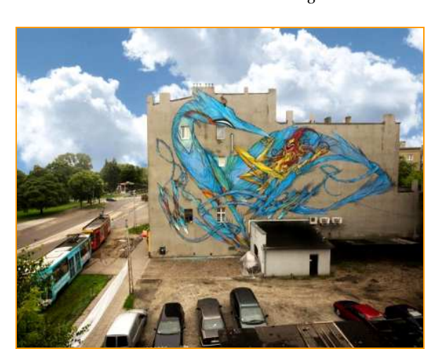
Photo 8. Mural at 82 Wojska Polskiego St, Łódź