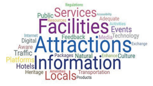
Figure 2. Word cloud of the important keywords obtained by content analysis