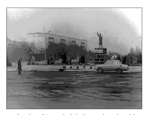
Fig. 1. Entrance to the city of Artemivsk in Lugansk region. Monument to Artem

The urban infrastructure is obsolete and local mayors are considered successful when they provide some cosmetic improvements to city centres. The European football championship of 2012 left behind a few stadiums and hotels in Donetsk, but had nothing like the impact on the economy promised by the Yanukovych government (Zhurzhenko 2014).