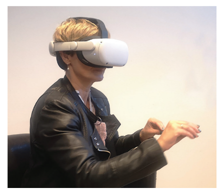
Figure 1. Examination using the Oculus Quest 2 VR device

For the study, in Unreal Engine 4.7 was created a computer program was installed and run on Oculus Quest 2 virtual reality goggles. Figure 1 shows an examination using goggles Oculus 2.