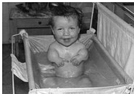
Figure 2. Contergan Baby

Thalidomid was isolated in 1956 by German chemist Heinrich Mueckler and commercialized the same year by the German pharmaceutical giant Gruenthal AG as Contergan, a tranquilizer and sleeping aid. Owing to its presumed safety and effectiveness, the drug became especially popular with pregnant women. However, having been inadequately tested, Contergan proved to be faulty, causing severe side-effects. In its fetus affective capacity, Contergan seems to be potent only during the first trimester. Between 1958 and 1961, about ten thousand deformed children were born to the drug using pregnant mothers, mostly in Germany but also in the Netherlands, Denmark, and Sweden. All the drug-induced deformities concern upper and lower extremities, spinal column, and knee joints, resulting in the condition commonly known as dwarfism (see Figure 2).