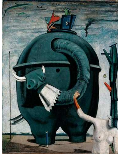
Figure 6. Max Ernst, Celebes, 1921

came to the realization that collage often lacks in the ability of creating a meaningful interface between different originally unrelated components. His new idea required a synthetic medium, a medium that would create a unified impression. But, some of the collages that immediately preceded the painting alert us to the possibility that the main constituents of the image were a female acrobat, a sleepwalker, and a machine for spreading oil on water. Ernst combined the acrobat and the sleepwalker in one image while “freezing” the oil coming out of the machine. The images were cut out from the medical, popular, and technical journals. The precursor to the teetering woman is the mechanical monster, “Celebes” (see Figure 6). xv