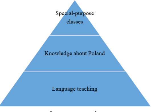
Figure 2. Categories of Polish studies classes

In 2016, BFSU developed the latest curriculum of teaching Polish language and culture for students of first-cycle studies. It is based on the many years of teaching experience of the Chair of Polish Language considering the driving idea of the reform of foreign language teaching in China, social changes, and market demands. As a result, a relatively mature teaching plan for Polish studies has emerged.