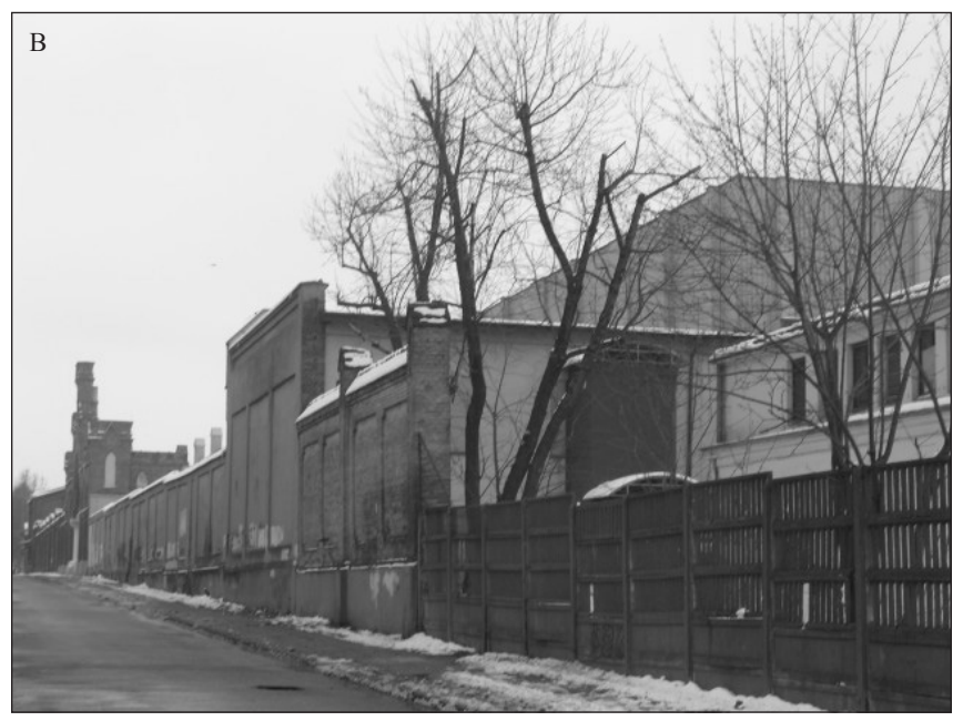
Fig. 2. Good and bad practices of fitting new investment into post-industrial areas in Łódź Special Economic Zone – Textorial Park (A) and Dakri Ltd. (B).