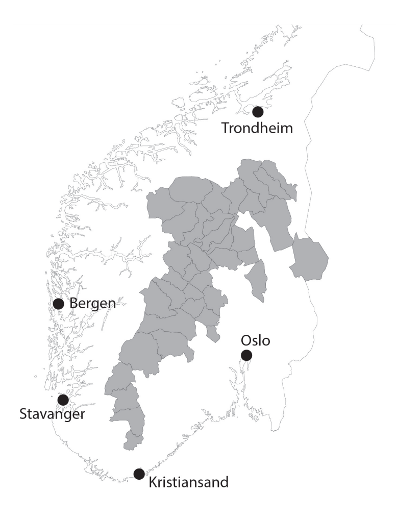
Fig. 1. Map of southern Norway where the location of the 38 municipalities in the mountain region of south-eastern Norway are shown in grey

Most ski resort or mountain destinations started with summer tourism, though today they are foremost winter destinations (Flognfeldt and Tjørve, 2013). After the Second World War, the mountain hotels and lodges were given a boost by the central government as cheap loans and other benefits, e.g., priority to rationed foods and other goods, were offered. The main purpose of these policies was to attract foreign visitors and consequently foreign currency, much needed to buy goods from abroad. Still, up until today domestic tourists has made up the better part of the market. For example, if we include the use of private second homes, then as many as 96% of ski tourists are Norwegians (Innovasjon Norge, 2019).