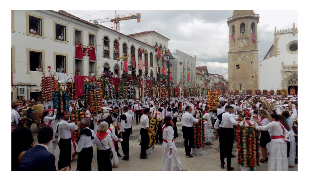
Fig. 1. Festa dos tabuleiros (festival of the trays)

to banquets and bodos , and also parades) it is spread all over mainland Portugal, with particular incidence in the regions of Extremadura and Beira, and also on the islands of Madeira and the Azores (Dionísio et al. , 2020).