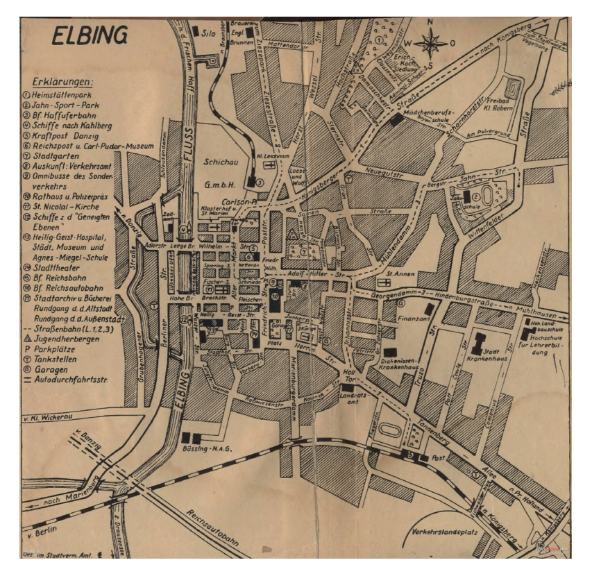
Map 1. F. Thebud, 700 Jahre Elbing: Festschrift zur Jubiläumswoche vom 21. bis 29. August, Elbing 1937

In secret material of the voivodship's praesidium, Elbląg's development plan starts by confirming that it "is a city inherited from the Germans".<sup>50</sup> The protracted reconstruction process following retroversion only started in the late 1980s.<sup>51</sup> From the postwar years until 1989, all that one found there was vegetation and some isolated buildings. Nevertheless, the early Polish maps did not indicate an abandoned or destroyed city centre. Maps dating from 1937 (Map 1) and 1949 (Map 2) look basically the same, except for the new street names.