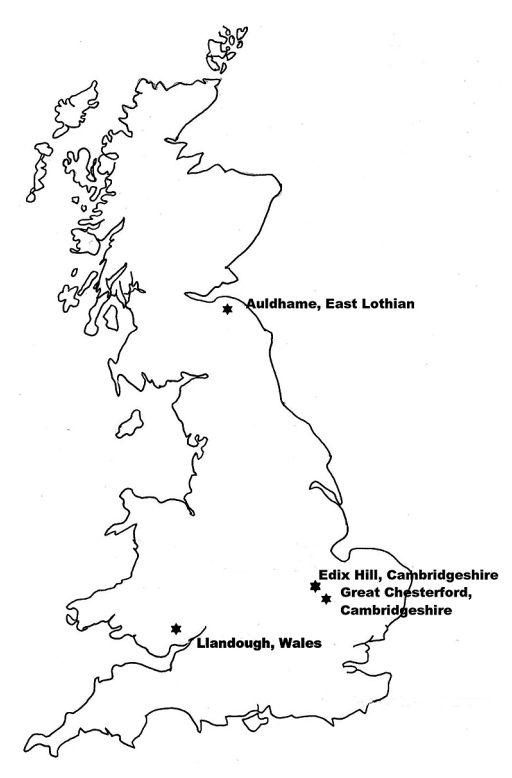
Fig. 1. Location of sites

seventh centuries. The cemetery of Edix Hill was situated on chalk Knoll surrounded by lower lying claylands (Gault clay) which is underlying geology of the area that had been exposed through localised erosion of the chalky upper deposits. The burials at Edix Hill were generally shallow and mostly comprised single interments with only a few graves containing more than one individual. There was little patterning in the orientation of the graves and it would appear that topographical factors were of more importance (Malim and Hines 1998). A concentration of non-adult burials was apparent in the area on the brow of the knoll, which may indicate a particular area of burial for children of all ages, as both infants and adolescents were buried