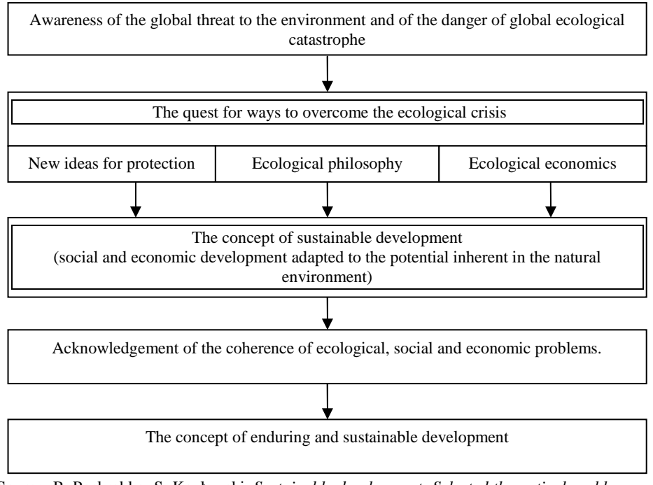
Figure 1. The process of shaping the concept of sustainable development